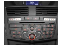
Factory Audio Unit (AHU)