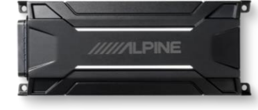
KTA-30MW Weather Resistant Mono Amplifier