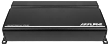
KTA-450 4-Channel Powerpack Amplifier