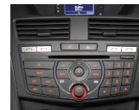
Factory Audio Unit (AHU)

• BT50-AHU5-7 • ILX-507A • KAE-2XDA-BT50