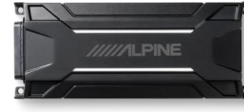
KTA-30FW Weather Resistant Powerpack Amplifier