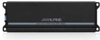
KTP-445U Powerpack Amplifier