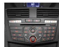
Factory Audio Unit (AHU)