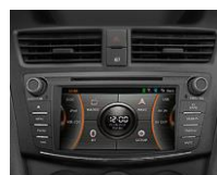
Factory Navi Unit (NHU)