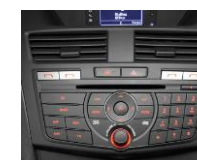
Factory Audio Unit (AHU)

• BT50-AHU5-7 • iLX-507A • KAE-2XDA-BT50