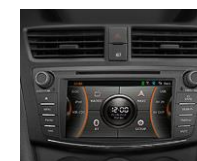
Factory Navi Unit (NHU)