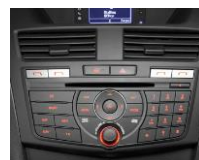
Factory Audio Unit (AHU)

• BT50-AHU5-7 • ILX-507A • KAE-2XDA-BT50