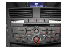
Factory Audio Unit (AHU)

• BT50-AHU4-7 • ILX-407A • KAE-2XDA-BT50