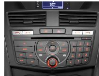
Factory Audio Unit (AHU)