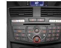
Factory Audio Unit (AHU)

• BT50-AHU4-7 • ILX-407A • KAE-2XDA-BT50