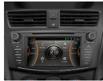
Factory Navi Unit (NHU)