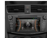
Factory Navi Unit (NHU)